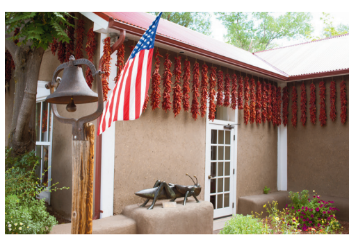
Ristras hang along the exterior of the restaurant.