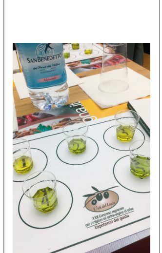
Professionally tasting olive oil is a serious and particular process.

As with wine, you can find some amazing olive oil coming out of California if you know where to look.