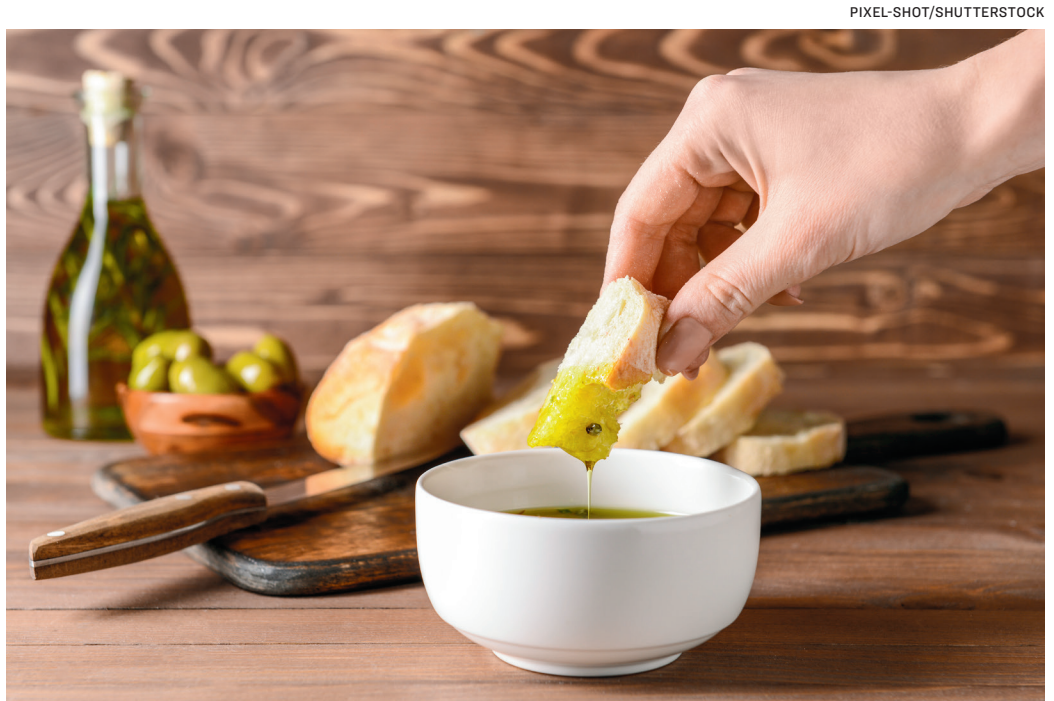
All you need to enjoy olive oil is a good, crusty loaf and some salt. The olive oil is the main event.